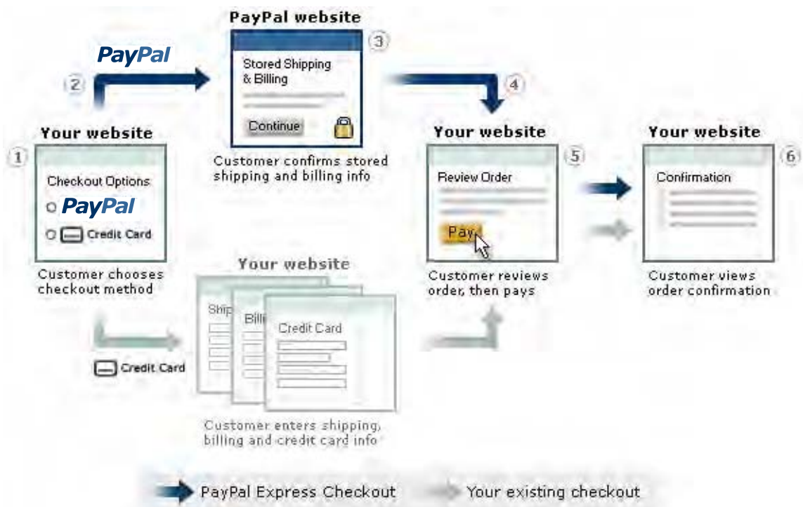
FIGURE 1.1 Recommended Express Checkout Process