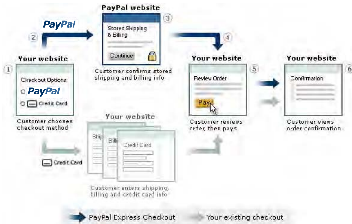
FIGURE 1.1 Recommended Express Checkout Process