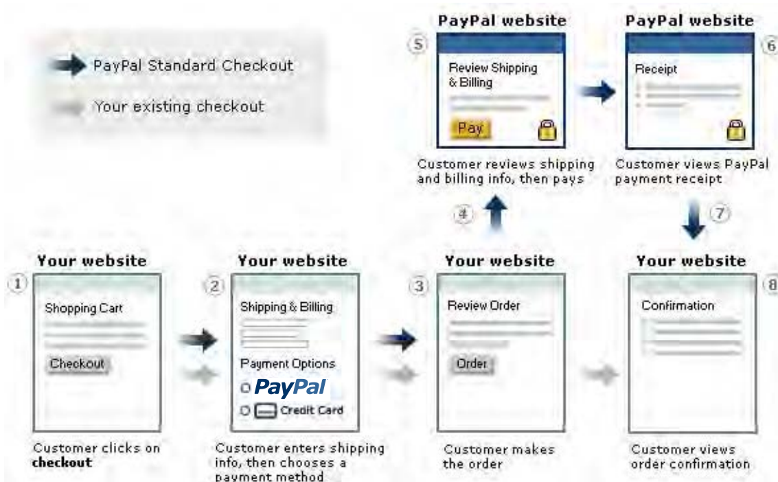
FIGURE 1.2 Standard Checkout Process With Your Shipping and Tax Calculators

If you collect your buyers' shipping and billing information during your checkout process to calculate the final order amount, implement the following Standard Checkout process, which uses your own shipping and tax calculators: